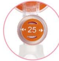
25 cmH 2 O