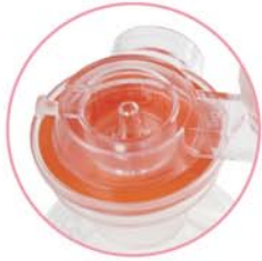
Pressure Monitoring Port