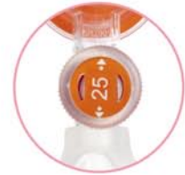
40 cmH 2 O